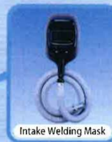
Intake Welding Mask

Welding fumes are absorbed through a duct in the forehead portion of the welding mask. Rising fumes are then able to be absorbed effectively.